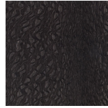
Grey Carbalho veneered